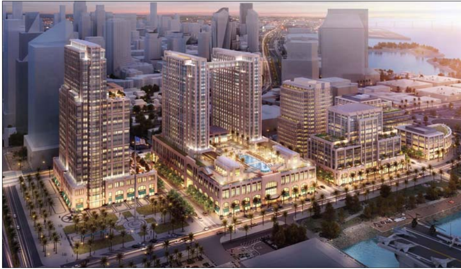
Lighted View of Development from West Side