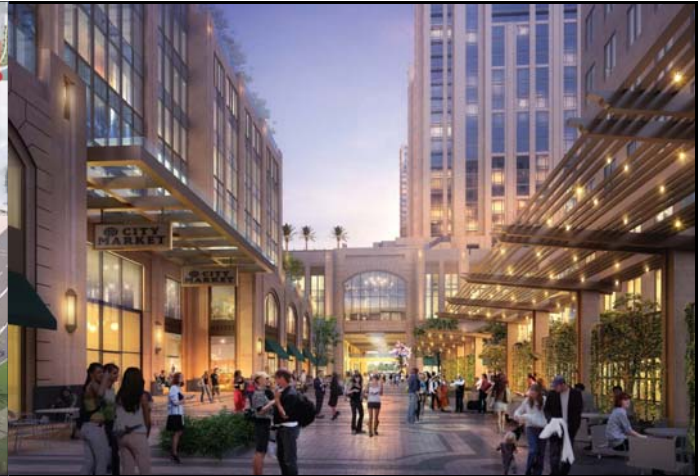
Lighted View of Paseo (3A), Facing North