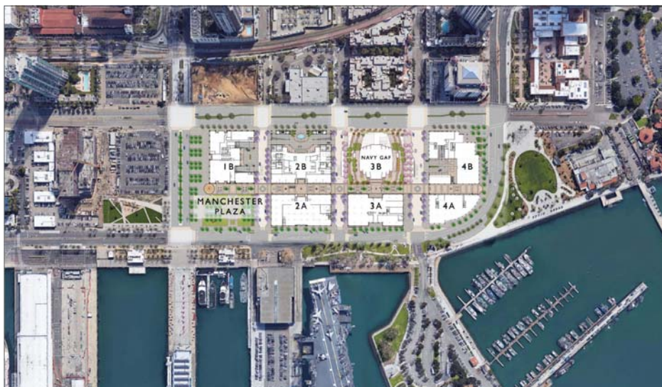
Site Plan for Manchester Pacific Gateway