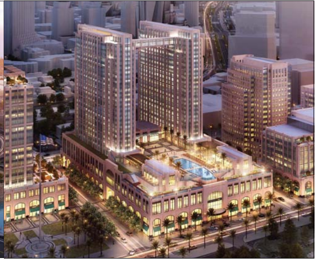
Lighted View of Hotel, Convention Center and Connecting Bridge