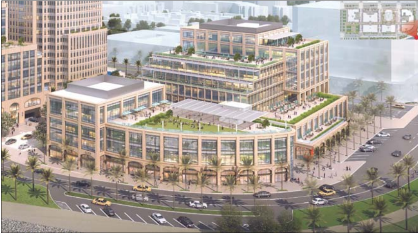
View of Retail Space (4A) and Office Building (4B) from Southwest Side

"Our goal is to develop a world-class waterfront destination for locals, tourists, employees and guests to enjoy, and to create job income and tax revenue for the city."