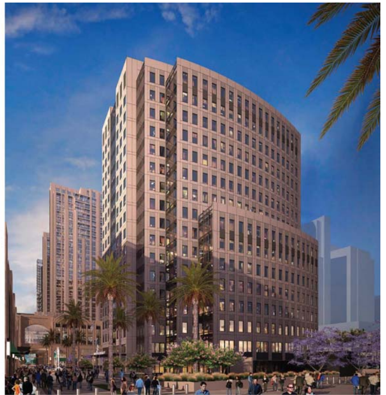
Views of U.S. Navy Building (3B)